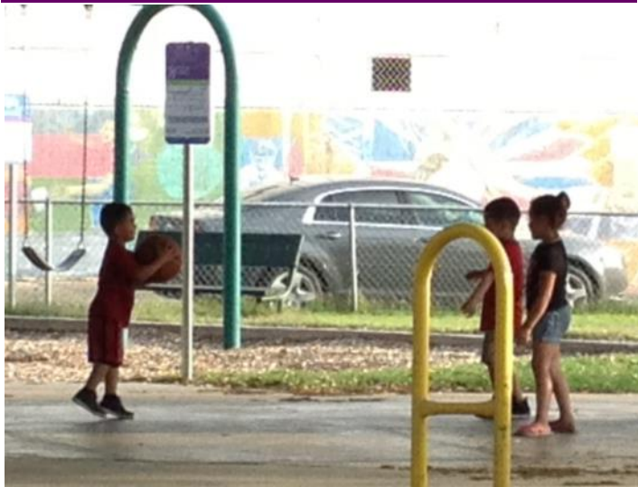
Neighborhood youth are enjoying our new four square game, hopscotch and freshly painted basketball court.